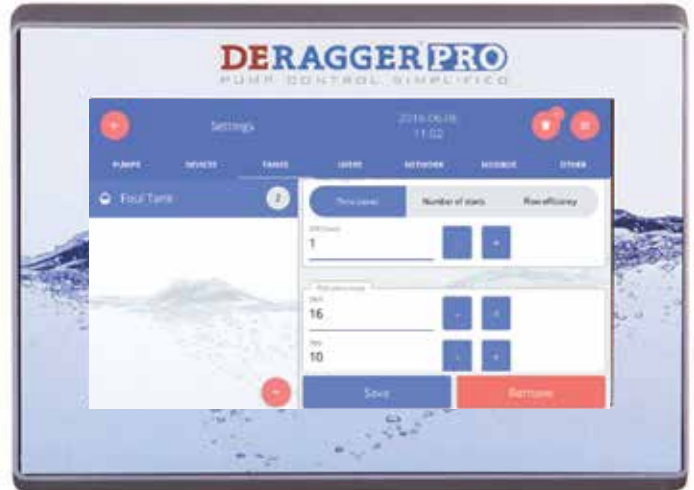
Tank Settings Screen

Takes minutes to configure rather than hours or days, using the intuitive interface via swipe touch screen similar to smart phone.