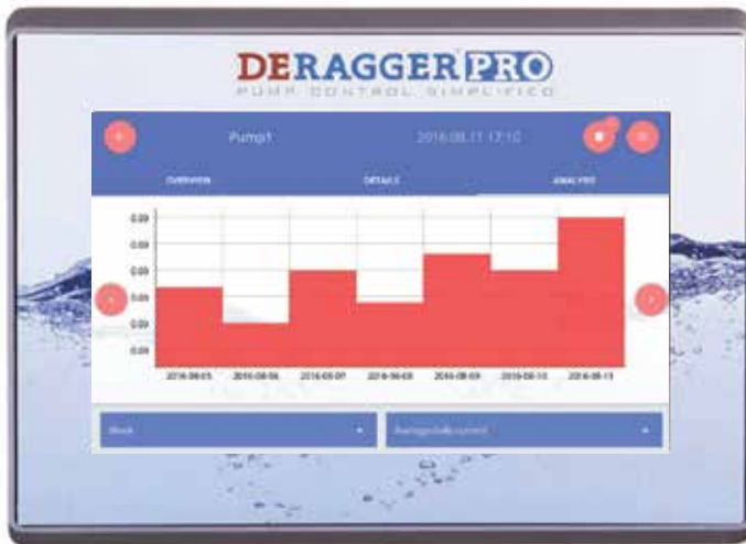
Pump Analysis Screen